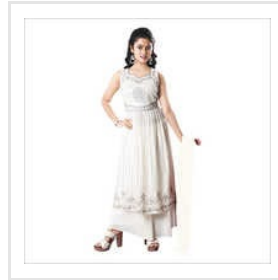
Girls Naira Cut Frocks