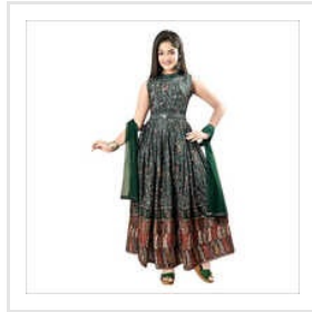
Girls Fancy Gown