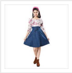
Denim Fabric Girls Frocks