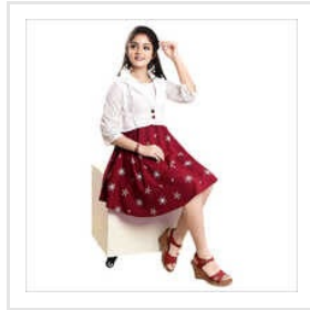
Girls Midi Frocks