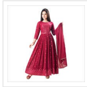
Girls Ethnic Wear