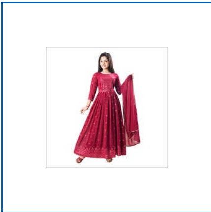
GIRLS ETHNIC WEAR