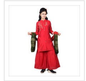
Girls Sharara Clothes